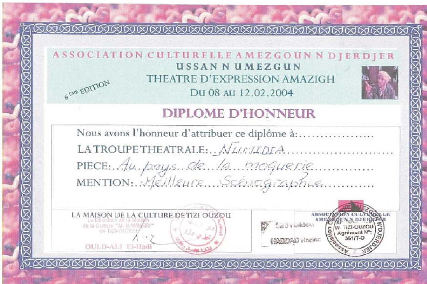
Arraz n " Usensayes amyifi " di Tizi-Wezzu, 2004.