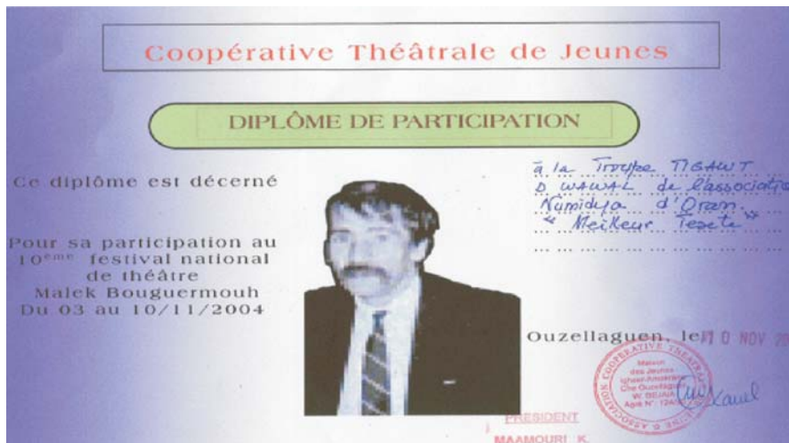
Arraz n " Weḡris amyifi" di Bgayet, 2004.